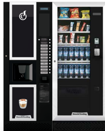
LEI400 + ARIA M MASTER

LEI400, automatic vending machine for hot drinks with 400 cups capacity.